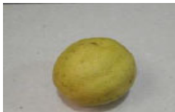
Fig. (2). Lemon.