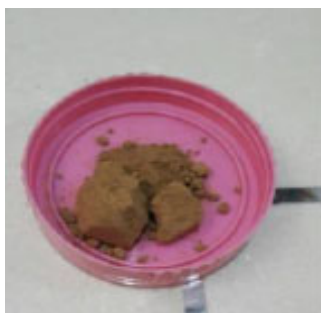
Fig. (3). Henna leaves powder.

also utilized in baking to assist the incorporation of fat into the dough and to let the formulation stay soft. Gum arabic or gum acacia is the dried gluey exudate obtained from the stem and branches of a tree, African nation (Linne) Willdenow and different connected species of acacia (Family Leguminosae). The gum has been recognized as associate degree acidic saccharide containing D-galactose, L-arabinose, L-rhamnose, and D-glucuronic acid. Tree is especially utilized in oral and topical pharmaceutical formulations as a suspending and emulsifying agent, typically together with gum. It is conjointly utilized in the preparation of pastilles and lozenges and as a pill binder [18 - 20].