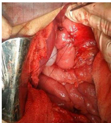
Fig. (3). Jejunal anastomosis duodenum A level II transmesocolonica duodenum.