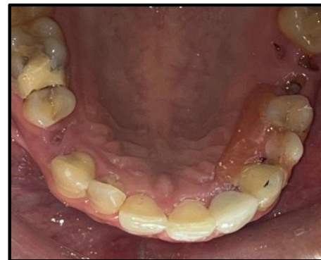
Fig. (8). Post operative - occlusal view.

The elastic modulus of fiber-reinforced posts closely approximates that of dentin, which has led to their increased clinical preference, especially in esthetically demanding regions. This dentin-like behavior allows for