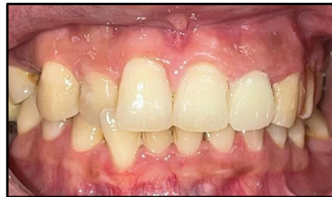
Fig. (7). Post operative.