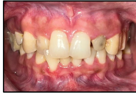
Fig. (5). Core build up.

Fiber-reinforced posts offer several advantages when compared with conventional post systems. Their ability to distribute functional stresses more favorably, along with their compatibility with adhesive bonding techniques, contributes to improved biomechanical performance. In addition, their inherent translucency facilitates harmonious integration with all-ceramic restorations, enhancing the overall esthetic result [7].