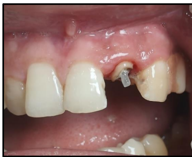
Fig. (4). Fiber post in position.

Fiber-reinforced posts offer several advantages when compared with conventional post systems. Their ability to distribute functional stresses more favorably, along with their compatibility with adhesive bonding techniques, contributes to improved biomechanical performance. In addition, their inherent translucency facilitates harmonious integration with all-ceramic restorations, enhancing the overall esthetic result [7].