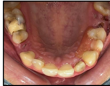
Fig. (6). Core build up- occlusal view.