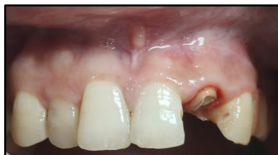
Fig. (1). PRE-operative.

Santosh Dental College and Hospital, Ghaziabad, following a traumatic fall. Her chief complaint was a fractured maxillary anterior tooth accompanied by compromised facial esthetics. The patient had no previous restorative or endodontic treatment on the affected tooth and maintained satisfactory oral hygiene. Clinical examination revealed no evidence of pain, swelling, or associated soft-tissue pathology. Intraoral evaluation identified an Ellis Class III fracture involving the maxillary left lateral incisor (tooth 22), as illustrated in Fig. (1). Radiographic assessment revealed loss of tooth structure involving the enamel and dentin with pulpal involvement. Pulp vitality testing further confirmed that the tooth was non-vital. The traumatic incident was isolated, and this clinical context guided our decision to use a conservative, adhesive fiber post-and-core system to preserve residual tooth structure.