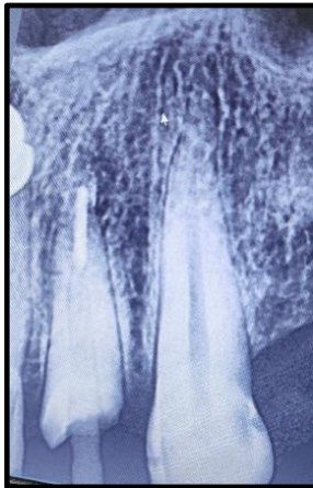
Fig. (3). Post space preparation.

Rehabilitation of a traumatically injured, endodontically treated anterior tooth requires careful consideration of multiple clinical factors. These include achieving adequate retention, evaluating the quantity and quality of remaining sound tooth structure, controlling occlusal loading, minimizing the risk of microleakage, and attaining acceptable esthetic outcomes. Endodontic procedures and traumatic insults often result in considerable loss of tooth structure, thereby necessitating the use of post-and-core restorations, particularly in teeth with extensive coronal destruction [5, 6].